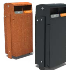
BORG 2 WASTE FLOWS 50L